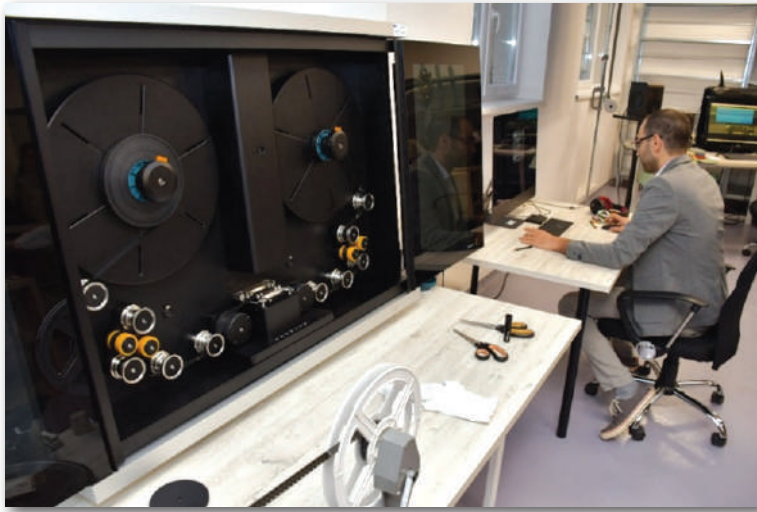
Fig. 4. Interactive Map of the Arts in Bulgaria Laboratory, Institute of Art Studies. 12 December, 2023

and Film Art in Bulgaria in the 20th Century (Compendium 2023) as well as the monograph of Joanna Spassova-Dikova The Bulgarian Theatrical Twentieth Century (Spassova-Dikova 2023). The culmination of the large-scale activity under the Heritage BG project is the creation and official opening of the Interactive Map of the Arts in Bulgaria Laboratory , the final focus of the work of the team of the sub-project Cultural Heritage in the Archives of the Institute of Art Studies: An Interactive Map of the Arts in Bulgaria (Fig. 4).