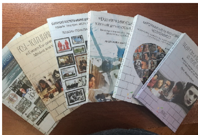
Fig. 5. Monographs produced under the project Post-totalitarian Bulgarian Cinema - Models and Identities (2019-2021)