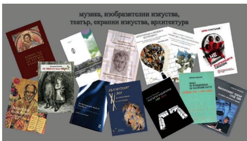
Fig. 1. Monographs by scholars from the Institute of Art Studies

Among the most cherished traditions of the Institute are the fundamental researches, and today the publications of its scholars lay the foundations of Bulgarian education and science in the field of arts. In the last five years, scholars from the Institute have published over 50 monographs, over 1,400 studies and articles, as well as catalogues, corpora, encyclopaedias, and collections (Fig. 1).