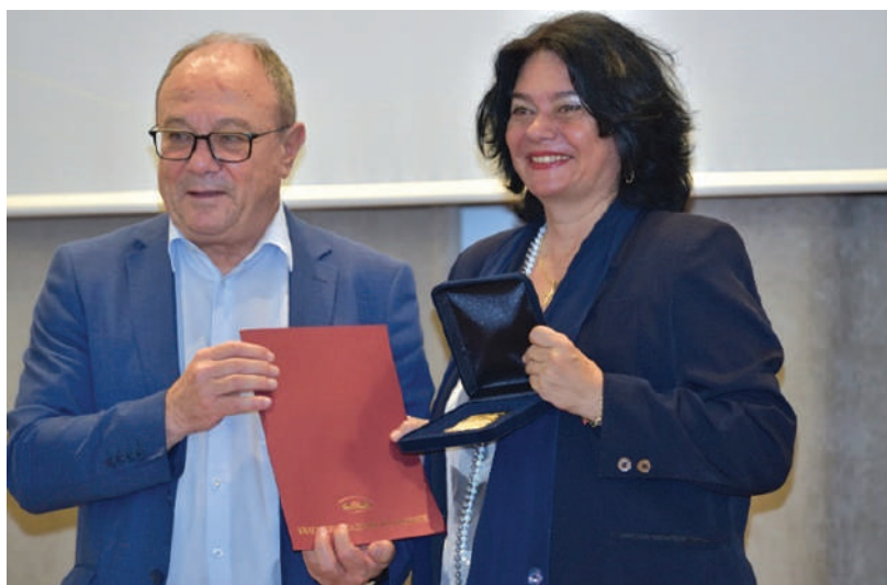
Fig. 7. Awarding the Honorary Golden Plaque of the Bulgarian Academy of Sciences