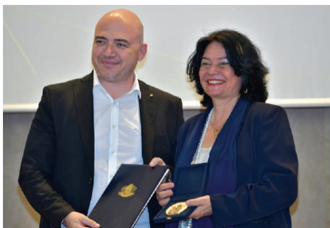
Fig. 6. Presentation of the plaque St. St. Cyril and Methodius from the Presidency