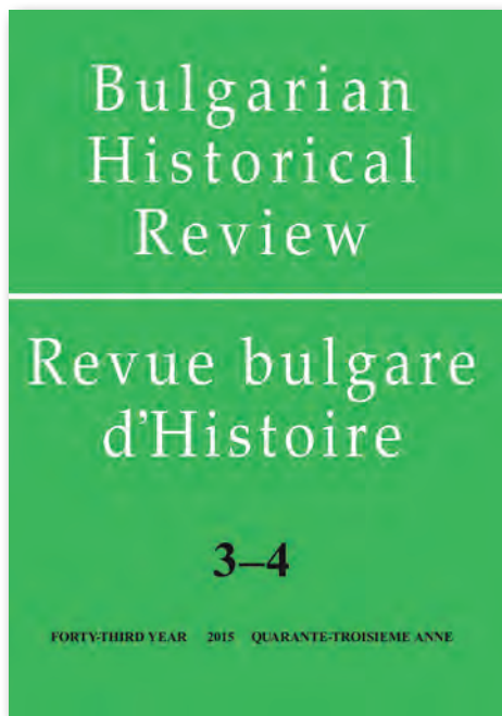
Fig. 2. Bulgarian Historical Review / Revue Bulgare d'Histoire - an organ of the Institute of History (Institute for Historical Studies) since 1989, first published in 1973