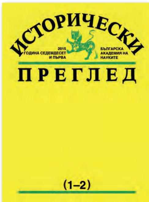
Fig. 1. Istoricheski pregled ("Historical Review") - the oldest and most prestigious historical journal in Bulgaria published since 1945

Despite these difficulties and in accordance with the Institute's strategy for development the scholars expand their research topics in the field of Bulgarian past from ancient times to the present, in European and world history, in archival and documentary studies, genealogy, etc., and continue to search for and publish sources for Bulgarian history. The Institute enhances its national and international recognition by publishing five periodicals with the expert editorial involvement of its scholars: Istoricheski pregled ("Historical Review"), Bulgarian Historical Review , Izvestiya na Institutata za istoricheski izsledvaniya ("Proceedings of the Institute for Historical Studies") (Fig. 1-3), Byzantinobulgarica and Pomoshtni istoricheski disciplini ("Auxiliary Historical Disciplines").